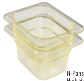
H-Pans™ High Heat Food Pans