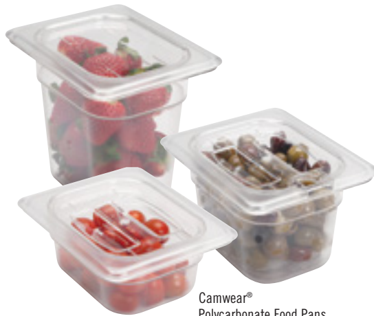
Camwear® Polycarbonate Food Pans