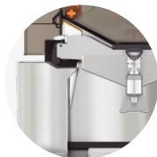
Speed S +plus Self Service Podium