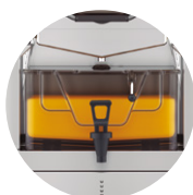
Speed S +plus Tank Podium