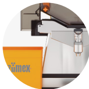
Speed S +plus Self Service