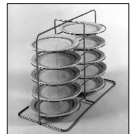
"P" carrier for open plates

OPTIONAL PLATE CARRIERS... "P" or "C" carriers are available. "P" type holds 8-3/4" to 10-1/2" diameter open plates while "C" type holds up to 10-1/2" diameter covered plates. Specify type, if any, when ordering. Carriers will hold plates 4-high (8C or 8P) in carts with 13" shelf spacing and 5-high (10C or 10P) in carts with 16" shelf spacing. See table on front page for types and quantities that will fit in each cart.