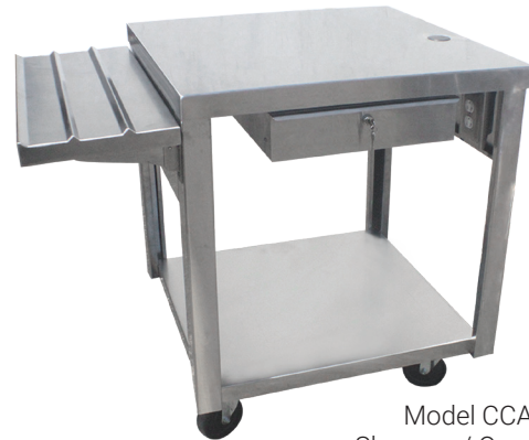
Model CCA-L Shown w/ Open Base