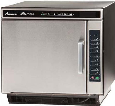
Model ACE19N shown