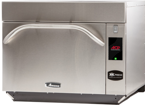
Model AXP22TLT shown

15 times faster than conventional ovens.