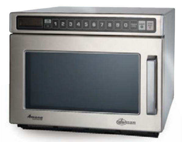
Model HDC212 shown