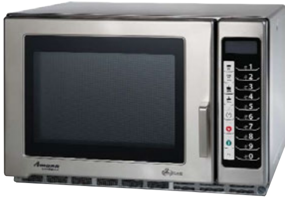
Model RFS12TS shown