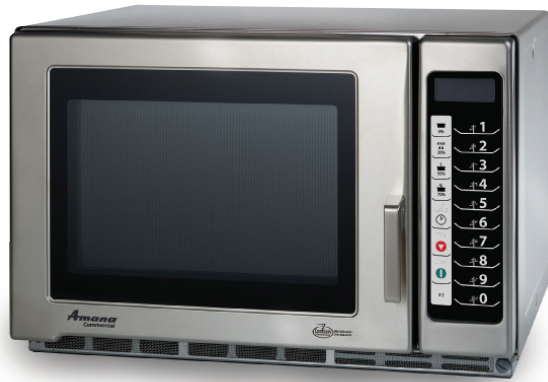
Model RFS18TS shown