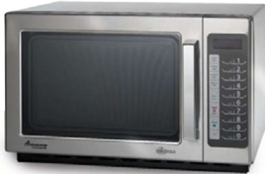
Model RCS10TS shown