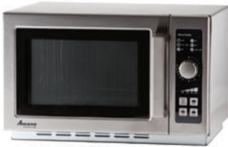
Model RCS10DSE shown