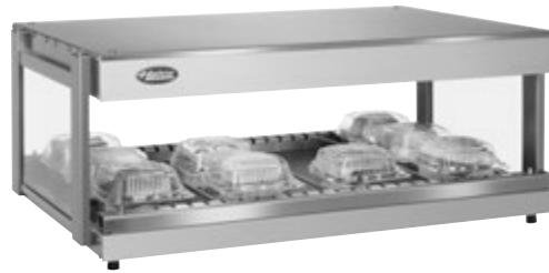
Model GRSDH-36 horizontal single shelf

Equipment On Signage Program Hatcographics.com