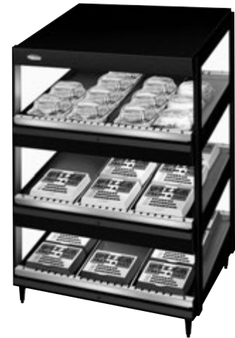
Model GRSDS-24T triple slant shelf in optional Designer black