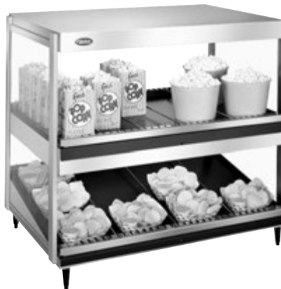
Model GRSDS/H-36D with slant shelf and horizontal shelf