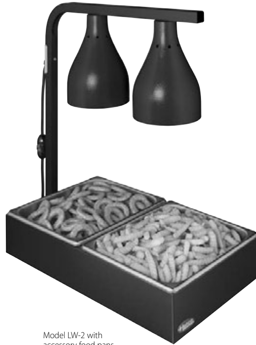
Model LW-2 with accessory food pans