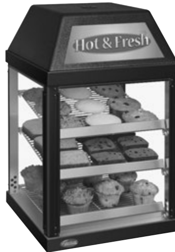
Model MDW-1X with optional hood with backlit sign cutout on one side (sign included)