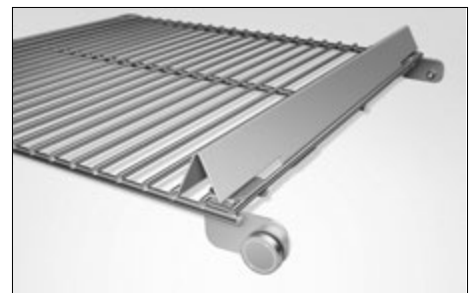
Magnetically adjustable shelves provide flexibility for a variety of product choices

METAL SHEATHED AIR HEATING ELEMENTS GUARANTEED AGAINST BURNOUT AND BREAKAGE FOR TWO YEARS.