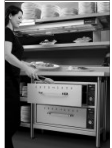
Model HDW-2 with optional stainless steel legs