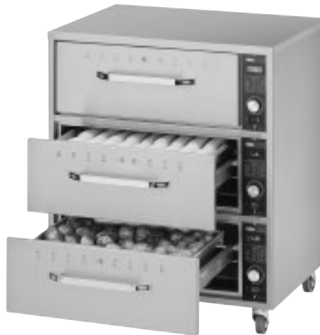
Model HDW-3 with optional casters