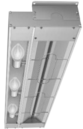
Model GRAML-36 with shatter-resistant incandescent lights, remote control enclosure (not pictured), and standard angle brackets