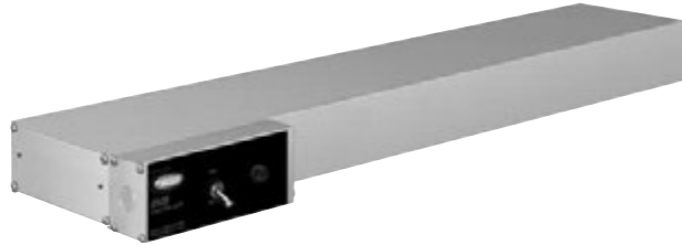
Model GRAM-18 with Control Enclosure with toggle switch and indicator light