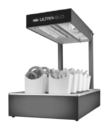
Model UGFFL in optional translucent gloss finish with accessory fry ribbon and food pan