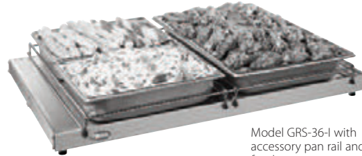
Model GRS-36-I with accessory pan rail and food pans