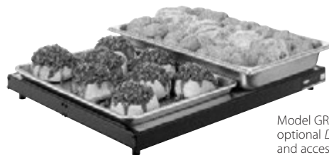
Model GRS-30-I with optional Designer color and accessory food pans