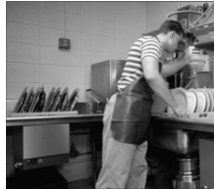
Water Temperature Recovery Table