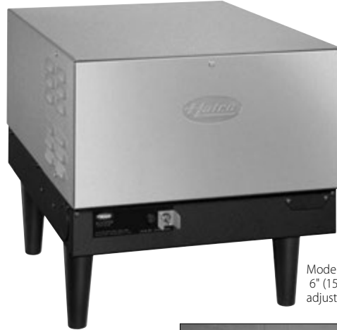
Model C-45 with 6" (152 mm) adjustable legs