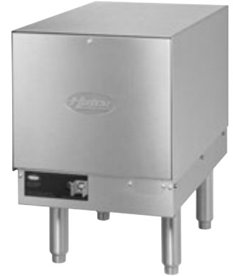
Model C-18 with optional 6" (152 mm) stainless steel adjustable legs