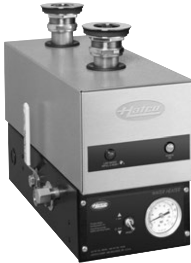
3CS-6 with optional temperature monitor