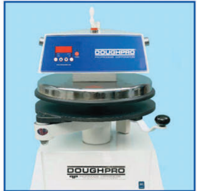
Requires remote or self contained compressor (DP1400C with CA200)