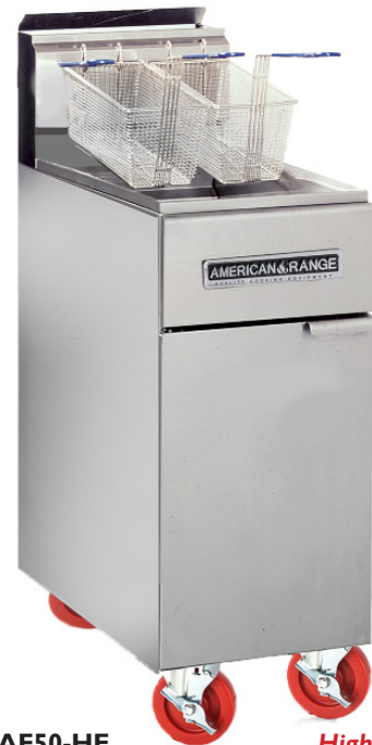
Model Shown AF50-HE Casters are optional.

High-Efficiency Power 3 each 25,000 BTU's/hr. Burners (total 75,000 BTU's)