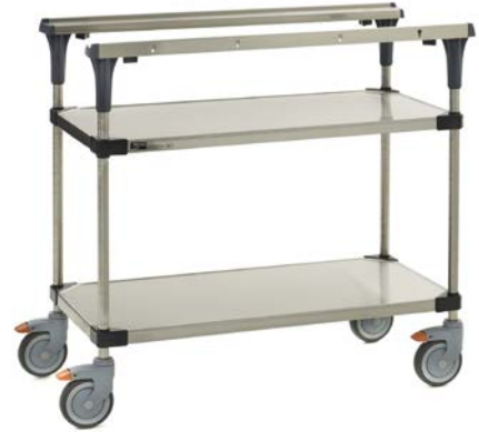
36" PrepMate shown with Solid Stainless Steel Shelves.

* Multi-Rails are capable of holding 800lbs evenly distributed on an 18"x24" work surface of sufficient strength centered in the unit.