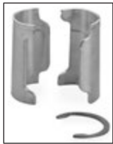
Aluminum Split Sleeve