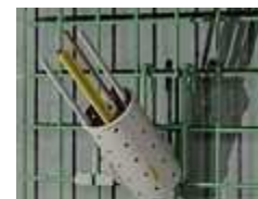
FC1 and FCH