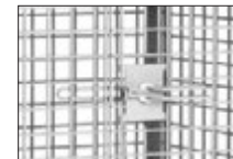
Ergonomic 1/4-turn door handle

VE models use two 5PCX and two 5PCBX casters.