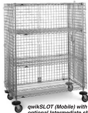
quwikSLOT (Mobile) with optional Intermediate shelves