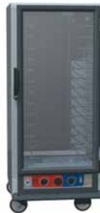
3 / 4 Height