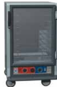
1 / 2 Height

C5 1 Series Non-Insulated Heated Holding and Proofing Cabinets