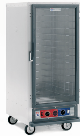
3 / 4 Height Fixed Slides Combination Module

C5 1 Series Non-Insulated Heated Holding and Proofing Cabinets