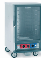
1 / 2 Height Fixed Slides Combination Module