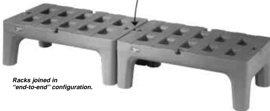
Racks joined in “end-to-end” configuration.

*MICROBAN® and the MICROBAN® symbol are registered trademarks of the Microban Products Company, Huntersville, NC.