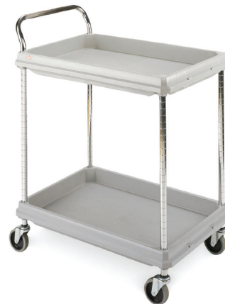
Deep Ledge Cart (2-shelf)