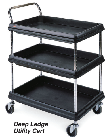
Deep Ledge Utility Cart

Note: Models feature (4) 4" (102mm) diameter swivel casters.