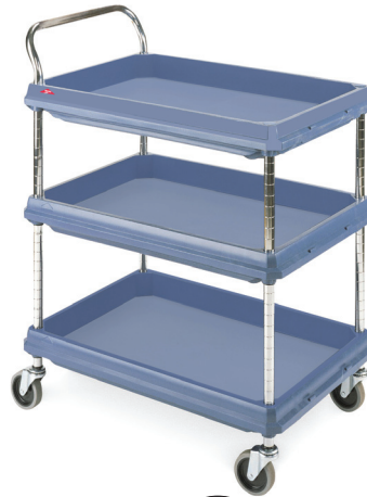
Deep Ledge Cart (3-shelf)