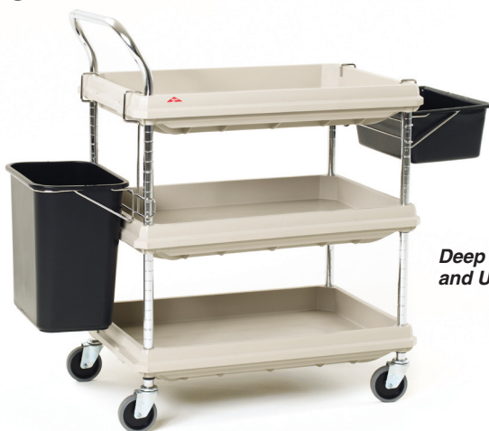
Deep Ledge Series with Wastebasket and Utility Bin Accessories