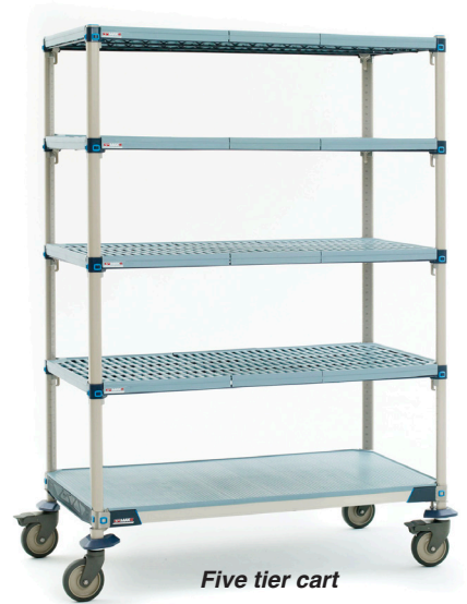
Five tier cart

Quick-to-adjust, corrosion resistant mobile shelving offers a sturdy, long lasting movable storage solution or transport cart. Rigid one-piece shelf frame with wraparound corners provides complete 360° capture of the wedge and post to ensure stability, and overall strength. Shelves have polymer shelf mats that are impact resistant for long life and quick-to-remove for easy routine cleaning. The shelf frames have a durable epoxy coating over an electroplated substrate. Shelves offer a 20 year warranty against corrosion. Rust proof polymer posts offer a lifetime warranty against corrosion. Shelf mats and posts have built-in Microban® antimicrobial product protection. Proprietary quick-release corner release enables fast, no-tool shelf adjustment. Each cart can safely store or transport 900lbs. (408kg). Units assemble easily — Shelves mount on four one-piece wedges along grooved, numbered posts. Shelves adjust on 1" (25mm) increments.