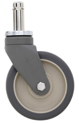
Rust Resistant, 5PCX caster