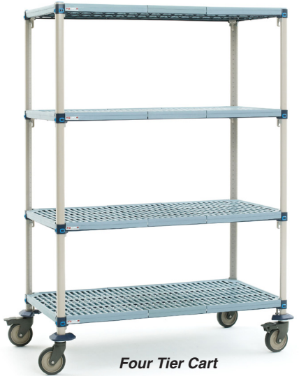
Four Tier Cart