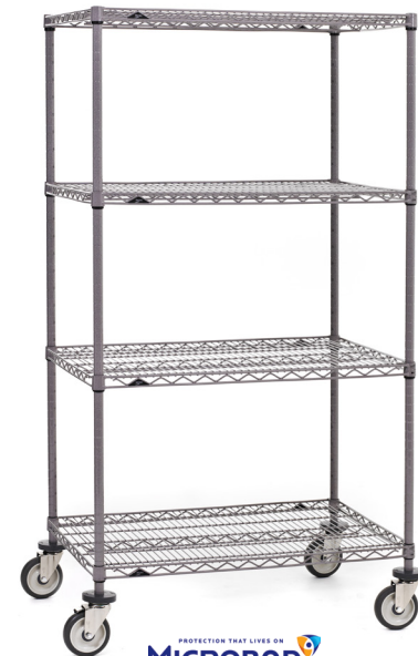
Super Erecta with Metroseal