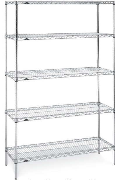
Super Erecta Chrome Wire

Note: Stainless stationary posts are equipped with stainless steel leveling feet.