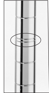
SiteSelect Posts feature double grooves every 8" (203mm) to aid assembly.