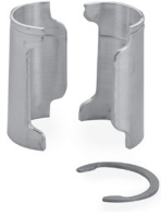
Aluminum Split Sleeve