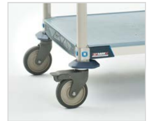
MetroMax i bottom shelf. Casters sold separately.