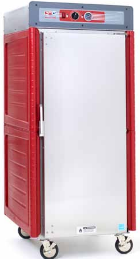
Full Height Full Solid Door