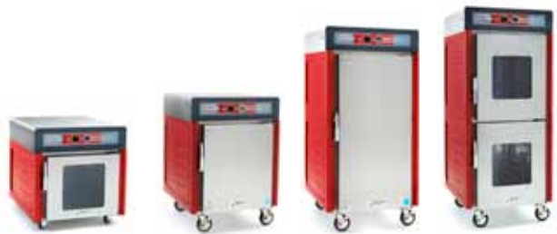
Under Counter Full Clear Door