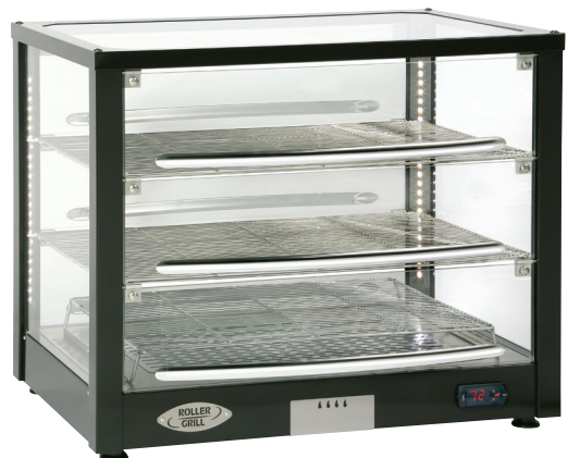
Shown with black exterior