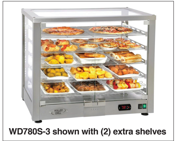
WD780S-3 shown with (2) extra shelves

765 WESTMINSTER STREET PROVIDENCE, RI 02903 TEL: (401)273-3300 FAX: (401) 273-3328 E-mail: sales@equipex.com www.equipex.com