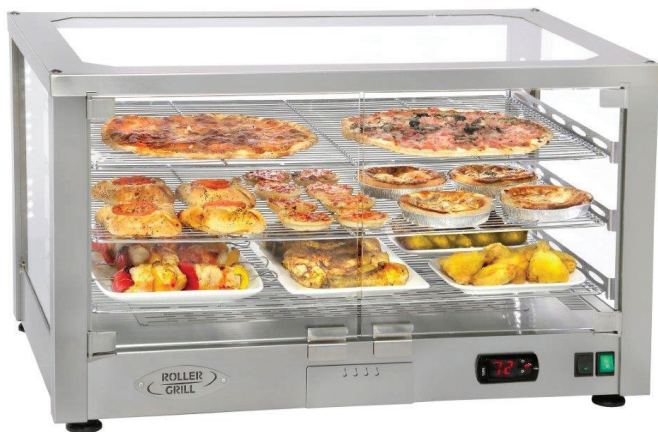
Shown with stainless steel exterior