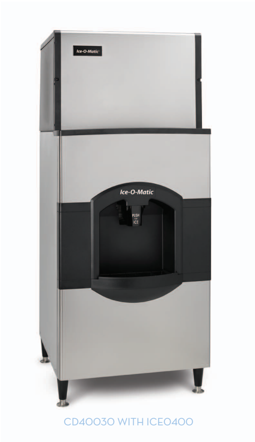
CD40030 WITH ICEO400