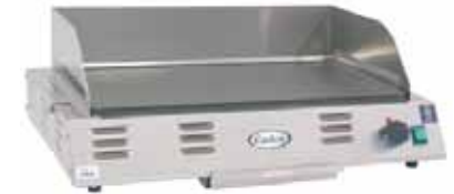
CG-10 120 volts/1500 watts/12.5 amps NEMA 5-15P Plug