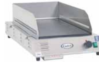
CG-5FB (Space Saver Front to Back Configuration) 120 volts/1500 watts/12.5 amps NEMA 5-15P Plug