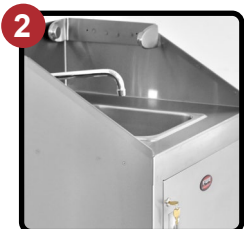
All Stainless Steel Construction