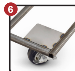
Built for Transport