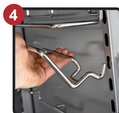
Adjustable Tray Slides