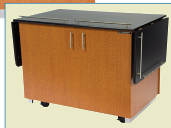
Optional Hinged Doors

Bring style, flexibility and ease to any office-dining occasion.