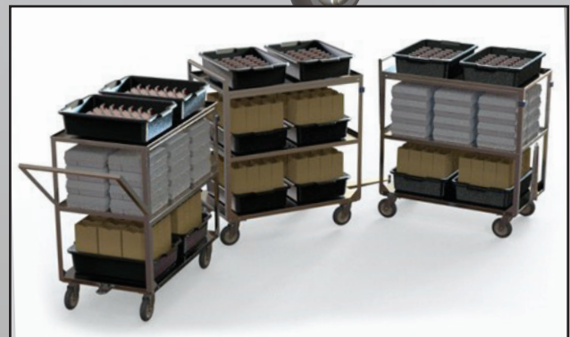
Built-in hitch system allows carts to be connected for high-volume transport.