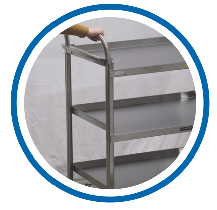
Three shelf ledges facing up to hold items in place during transport