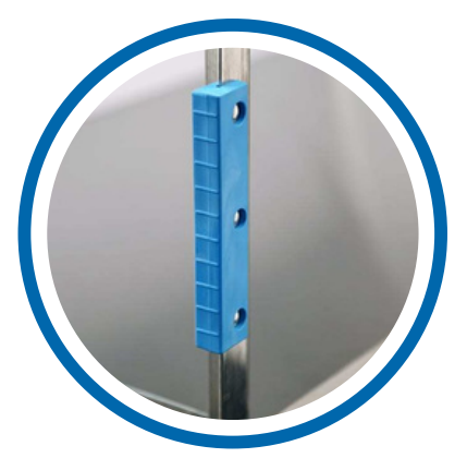
Leg bumpers help protect walls and furnishings