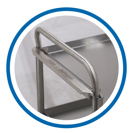
Swing-out handle locks easily and securely in upposition for pushing action