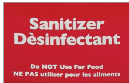
Trilingual Labeling aids in employee training (English-Spanish on front, English-French on back panel)