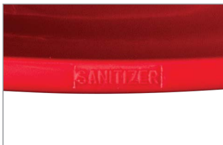
Raised Lettering ensures meeting health code guidelines