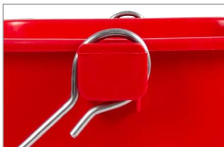
Durable Handle Design prevents broken or lost handle