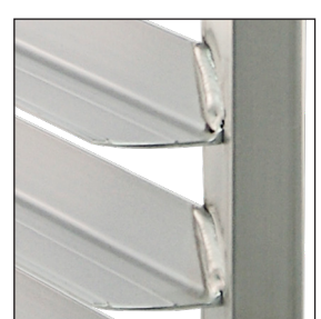
6000 Series Angle Guides and Welds