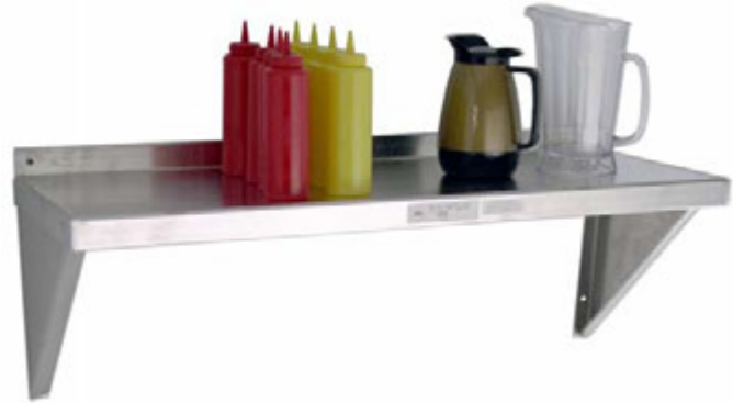
Solid Wall Shelf

These wall shelves carry a Lifetime Guarantee against rust and corrosion and also carry a Five-Year Guarantee against workmanship and material defects.