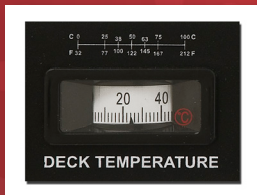
Cabinet Temp Indicator