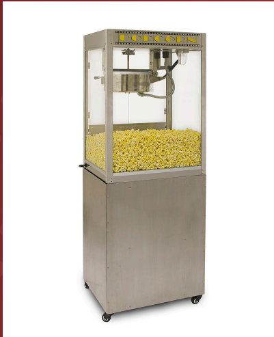
Silver Screen 14 with Optional Pedestal Base

The Silver Screen Professional Popcorn Machines are our most technically advanced models. These models incorporate a separate cabinet thermostat and temperature indicator. This Benchmark USA innovation allows you to accurately control the heat in the food zone ensuring that your popcorn is always at the perfect serving temperature. Each Silver Screen model has a stainless steel cabinet and food zone insuring years of durability. The Silver Screen Poppers utilize a hard-coat anodized, high Thermal Mass Kettle for easy cleaning and superior performance. The four-switch configuration allows for any operating situation. They are available in a space saving 8 ounce model and a high production 14 ounce model. Either model will work on a standard 15 amp circuit so that it can be used anywhere without any additional electrical wiring. Optional stainless steel pedestal bases with heavy-duty casters and storage capabilities are available for either model.