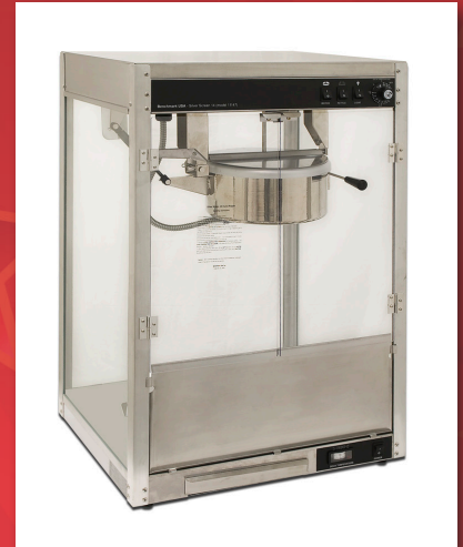
Silver Screen 14 Popper