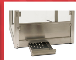
Old Maid Drawer