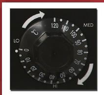
Thermostatically Controlled Serving Temp