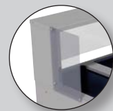
Acrylic Side Panel for Serving Shelf

Add side panels to meet additional NSF requirements (1 panel per side)