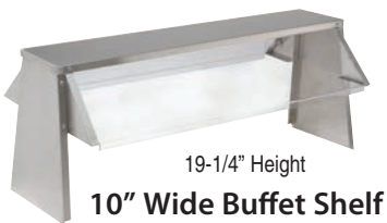
10" Wide Buffet Shelf with Built-In Food Shield