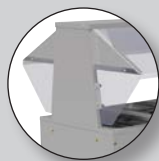
Acrylic Side Panels for Buffet Shelf

Add side panels to meet additional NSF requirements (2 panels per side)