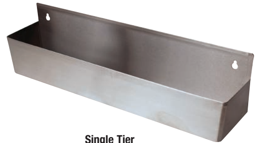
Single Tier BK-2 Shown