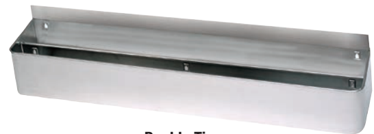
Double Tier DT-4 Shown