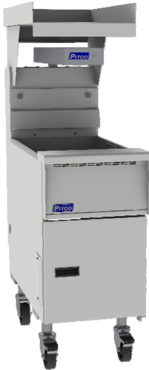
SGBNB18 with optional food warmer, top shelf and casters

To be used with the Solstice Fryer line. Unit can be installed on either side or between fryer(s). Design to match existing or accompanying fryers. Pan area allows for holding and draining of finished product. Drain screen easily lifts out for cleaning. Bottom Shelf provides ample storage for breading, batter, food utensils, etc. *Bottom Shelf is not provided when a filter pump or flush hose is located inside the dump station.